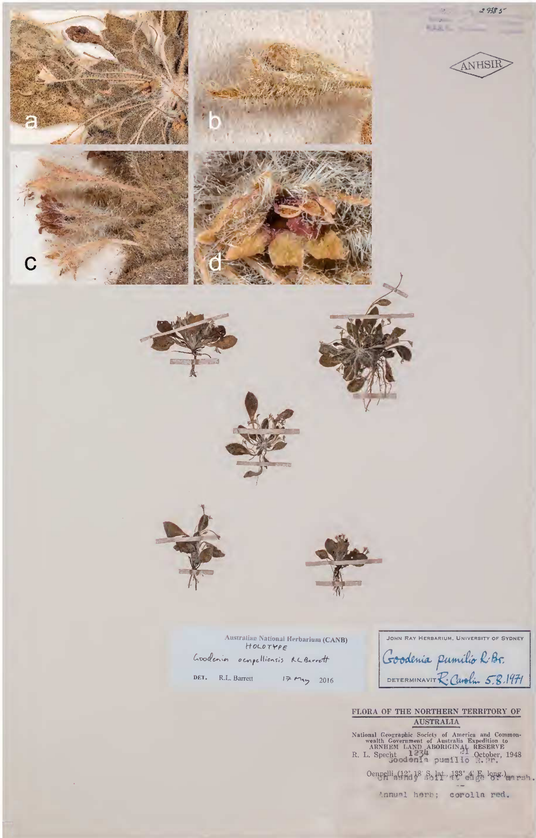
Fig. 3. Goodenia oenpelliensis . R.L. Specht 1234 (CANB). Inset a. leaves and inflorescence; Inset b. calyx; Inset c. inflorescence. Inset d. flower. Images by R.L. Barrett.